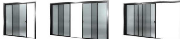
Single slider Double slider Stacking slider