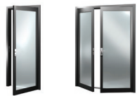
Single door French doors