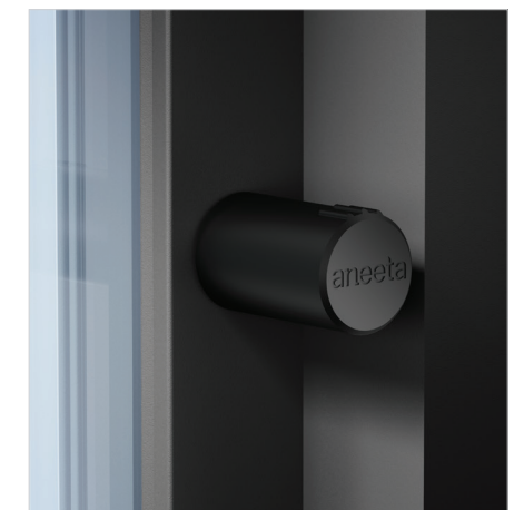
Sleek, black key cap option available.