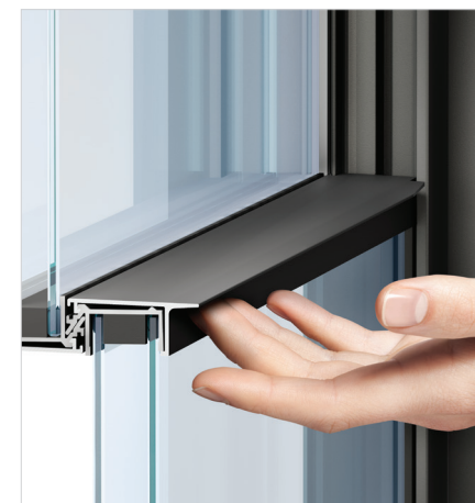
Easy pane operation via slimline meeting rail design with integrated lift handle in most applications.