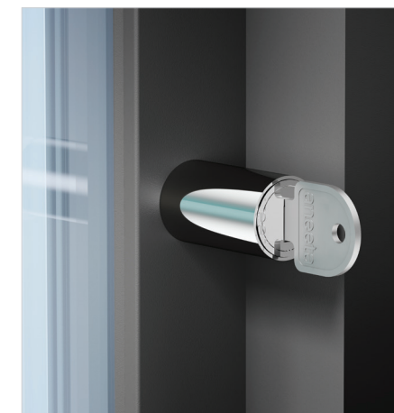
Stainless steel lock and key as standard.