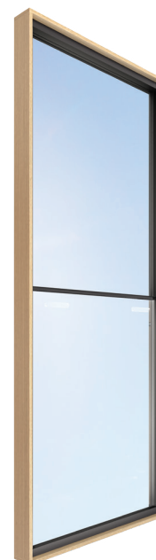
Vertical Thermaglide window two pane counterbalanced movement.