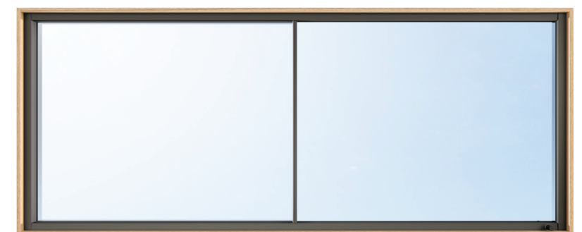
Horizontal Thermaglide window with one fixed and one operable pane.